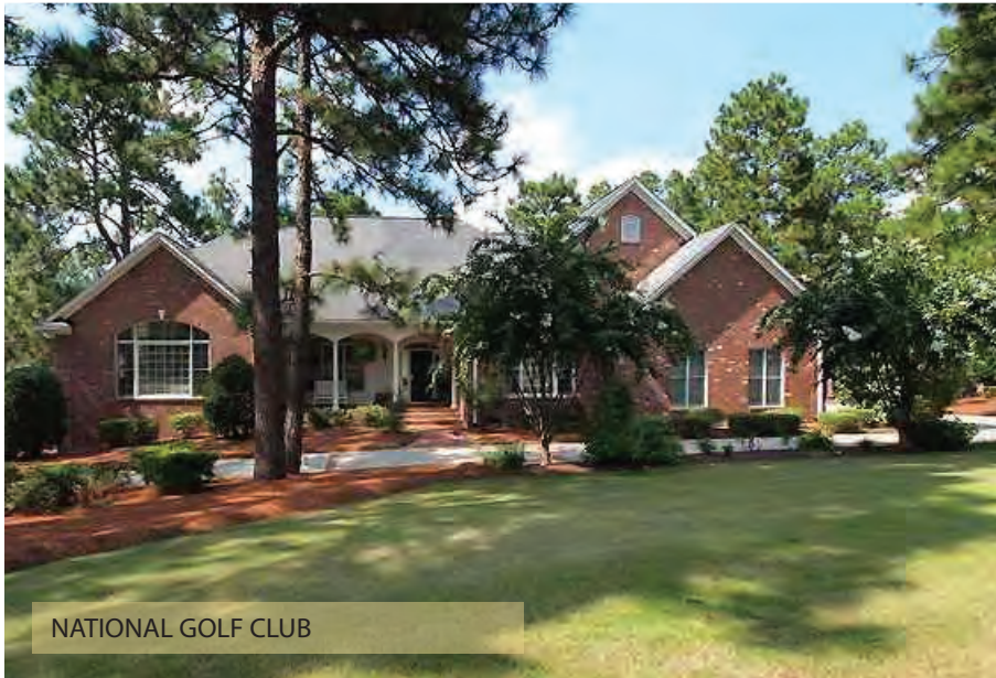
NATIONAL GOLF CLUB