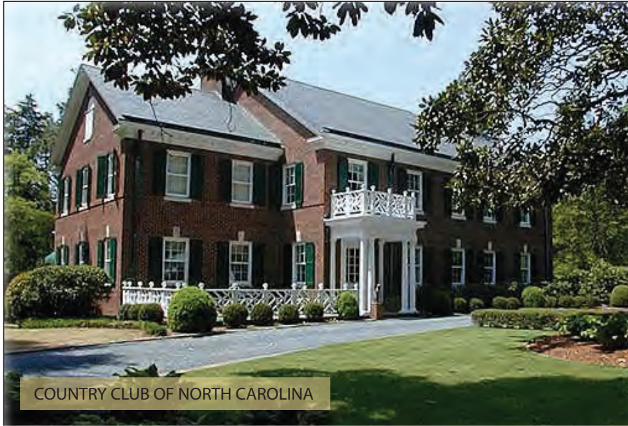
COUNTRY CLUB OF NORTH CAROLINA