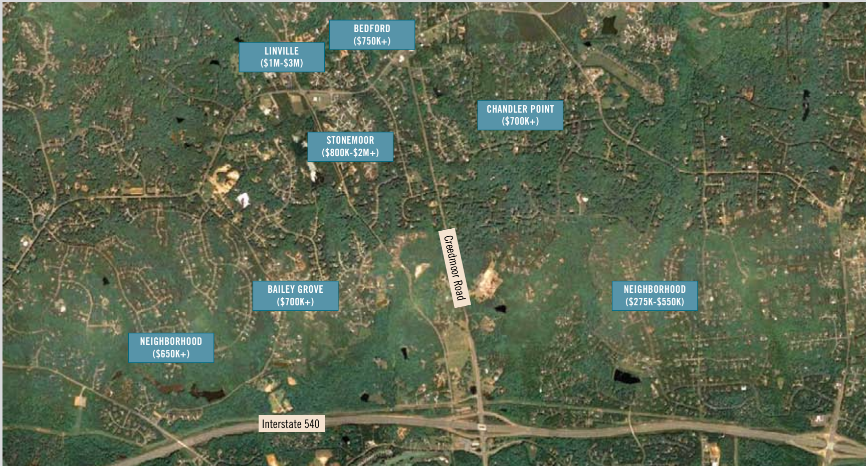
SURROUNDING NEIGHBORHOODS (North)